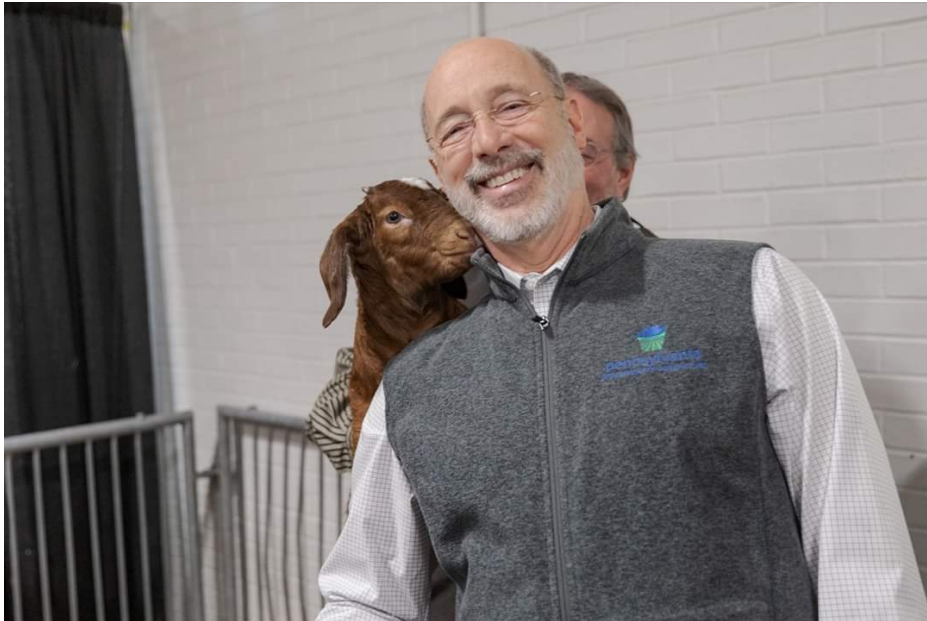
PROMOTING THE GOAT with assistance from the Pennsylvania Governor, Tom Wolf. - Picture from the January Pennsylvania Farm Show where the Pennsylvania folks displayed and handed out information about goats and AGF.